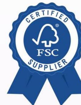
Responsible Forestry Management (FSC)