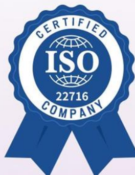
ISO 22716 Cosmetics GMP