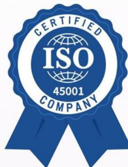
Occupational Health & Safety Management System