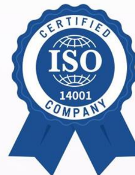
Environmental Management System